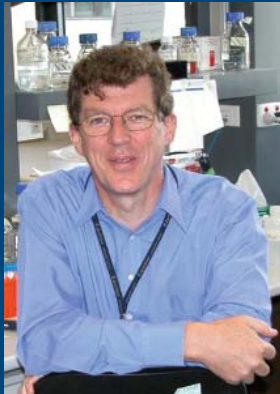
Professor Ian Frazer Developer of the cervical cancer vaccine Director, Diamantina Institute 2006 Australian of the Year Member of the PA Foundation Board